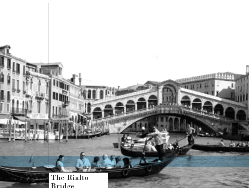
The Rialto Bridge