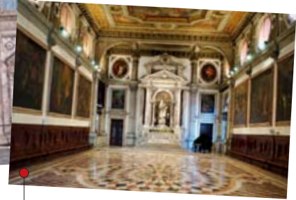
Scuola Grande San Giovanni Evangelista