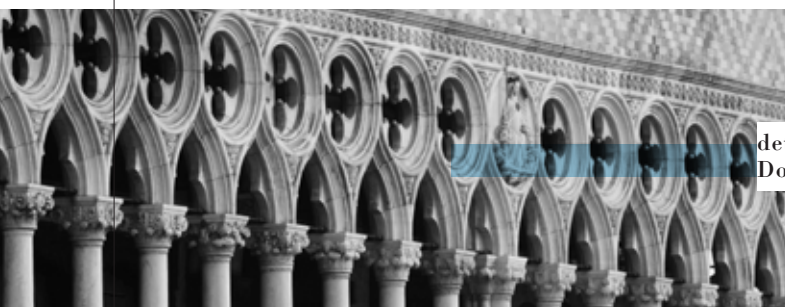
detail of Doge's Palace