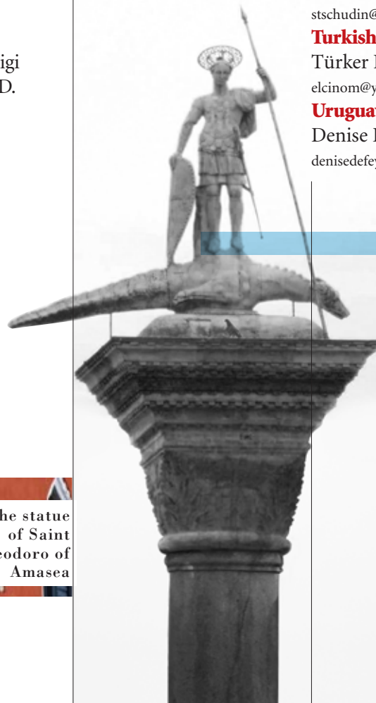
the statue of Saint Teodoro of Amasea