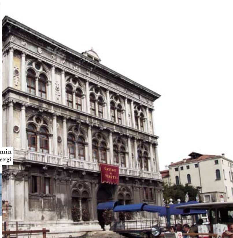
Ca' Vendramin Calergi

An unforgettable Gala evening will take place on Saturday October 30 th , a private visit of the Guggenheim museum will be followed by a wonderful dinner in Ca' Vendramin Calergi, one of Venice's greatest Renaissance palaces, an elegant building and a majestic presence on the Grand Canal.