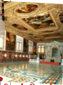
Scuola Grande di San Rocco

Both schools are located in the center of Venice near the railway station.