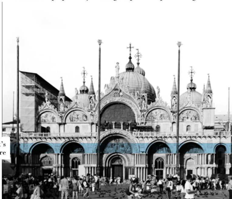
San Mark's square

Recommended preparatory reading: http://www.ptoweb.org